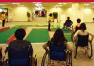
Experience opening and closing doors and other obstacles while in a wheelchair.