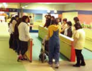
Experience the comfort and functionality of an electric wheelchair.