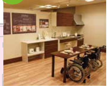
This zone exhibits models of barrier-free housing and offers suggestions for a variety of situations such as the living room, kitchen, and bedroom.