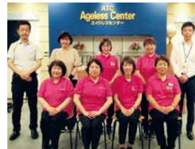
We are the Ageless Center floor staff.

During the exhibition, our floor staff will provide information to guests on behalf of the exhibiting companies.