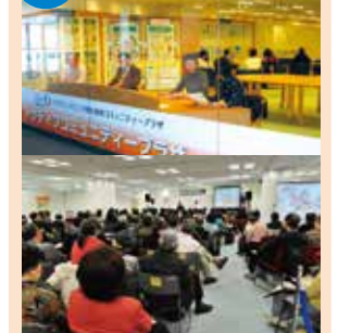
The purpose of the Active community plaza is to decrease the need for nursing care and is a community space for active seniors who wish to celebrate a bright, fun, and cheerful after-retirement life. Focusing on supporting elderlies 50 and over, we provide information on a wide range of topics such as lifestyles, hobbies, health, work, and active participation in society. In addition, we hold a large variety of events and seminars.