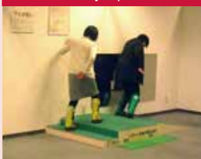
Put on the equipment and experience what it's like to be an elderly.